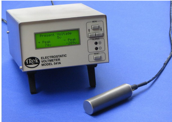
Trek 541A with Probe

The walking test adapter kit [CN 1K037] for the Trek 541A series allow analysis of charge levels accumulated on the human body per compliance with ANSI/ESD STM 97.2. and IEC Standard 61340-4-5. The electrostatic charge and the ability for charge accumulation of a person walking on an ESD safe floor with ESD safe footwear can be measured with a walking test adapter. This test, in addition to data from standard resistance measurements, provide measurement data on the actual charge on a person while walking. This test ensures ESD safe practices are being implemented properly and that charge is being maintained under the maximum allowed voltages (typically less than 100V as per ANSI/ESD S20.20-2007, IEC 61340-5-1:2007, and IEC 61340-5-2:2007).