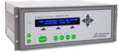
Advanced Energy's Innova 1314i

The Innova 1314i can perform area monitoring and features ppb detection levels thanks to photoacoustic technology. The trace gas detector Innova 1314i can be bundled with multi-zone sampling systems with up to 24 channels.