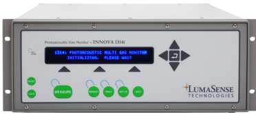
INNOVA 3433i Photoacoustic Gas Monitor.