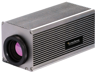
MC320 Thermal Imager