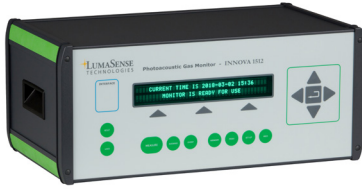
INNOVA 1512 Photoacoustic Gas Monitor.