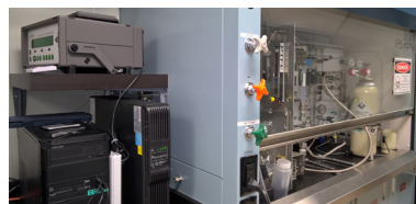
The Innova 1512 Photoacoustic Gas Monitor is conveniently located next to the test bench (inside the fume hood) and provides online measurement from direct sampling ports.

The above table gives an example list of challenge gases, with challenge concentration and breakthrough detection levels. The values for cyclohexane, sulfur dioxide, and ammonia correspond to the NIOSH Statement of Standard for Chemical, Biological, Radiological, and Nuclear (CRBN) Full Face-piece Air Purifying Respirator (APR).