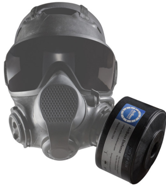
Air purification devices, such as respiratory mask filters, have to be tested according to standard tests, in particular to check their compliance for breakthrough time.

Using precise multi-gas monitors is crucial for breakthrough testing of air purification devices to ensure that specific quality standards are being met.