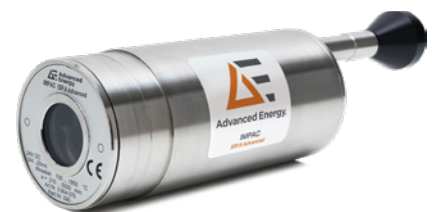
Impac ISR 6 Advanced

The pyrometer measures the very bottom tip of the blind tube, which reaches thermal equilibrium with the environment inside the furnace.