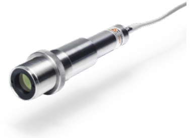
Mikron PhotriX series

The Advanced Energy pyrometer is optimized to measure as close as possible to the seed layer.