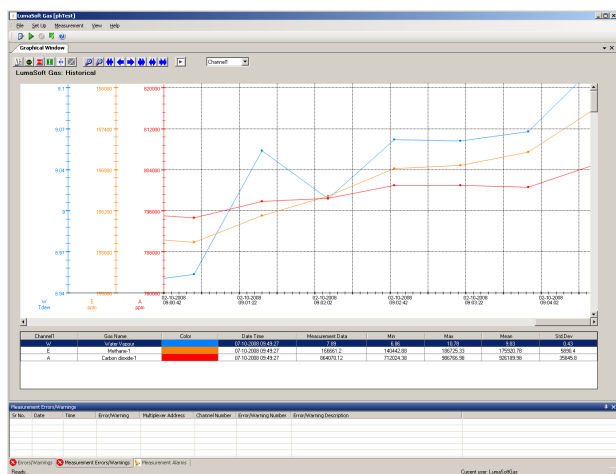
Fig. 1: The graphical window shows up to seven graphs. The user selects the data plotted, the scaling, and the style and color of the lines and background to build the graphical window.

In the 7820/7880 software, the graphs can be configured to display only the desired gases, defined concentration ranges, and results from statistical analyses. Also, when using the 7880 software, all measurement data is stored in user-defined SQL Server 2014 database.