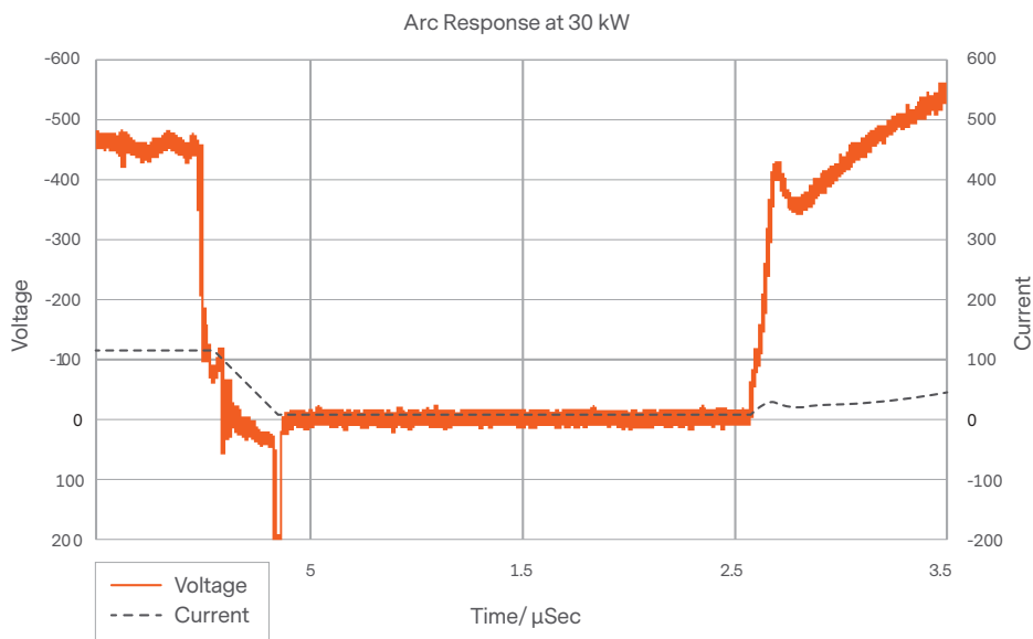
Figure 1. Fast detection, shutdown, and recovery from arc events