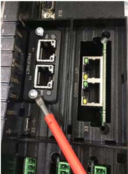
Figure 6. Anybus module removal

If an Anybus module must be removed from the unit, loosen the TORX T8 mounting screws 3 turns, and pry out the module with a small flat-bladed screwdriver, as shown in the following figure.