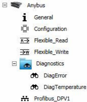
Figure 3. Anybus parameter group

If the unit is not available for online configuration, the software can also be configured offline. Contact AE Global Services to obtain a parameter file appropriate to your hardware configuration.