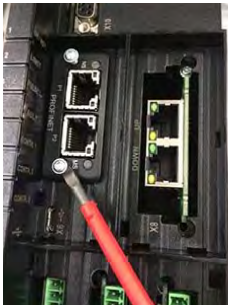
Figure 6. Anybus module removal

If an Anybus module must be removed from the unit, loosen the TORX T8 mounting screws 3 turns, and pry out the module with a small flat-bladed screwdriver, as shown in the following figure.